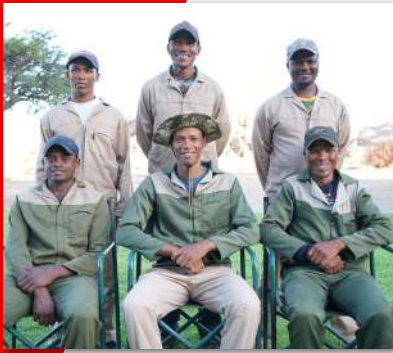
Skinner's & Trackers