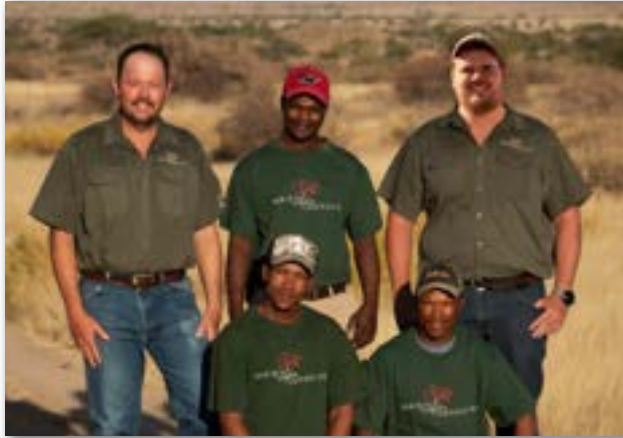
Skanners & Trackers