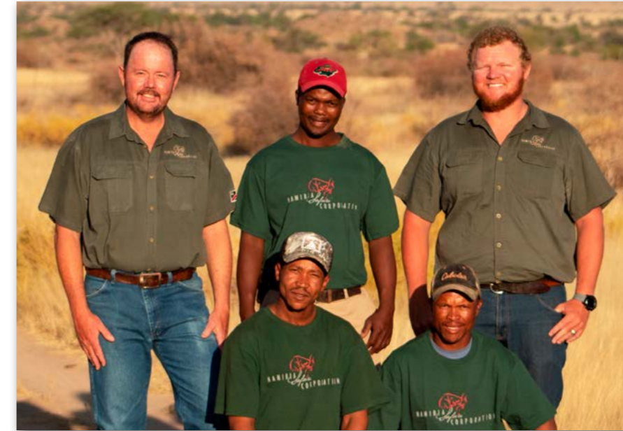
Skippers & Trackers