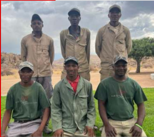
Skinners & Trackers